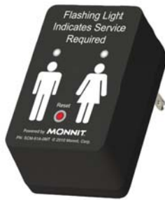
Notification Unit Dimensions (3 in. x 2 in. x 2 in.)