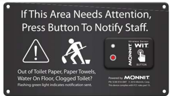
Restroom Wall Plate