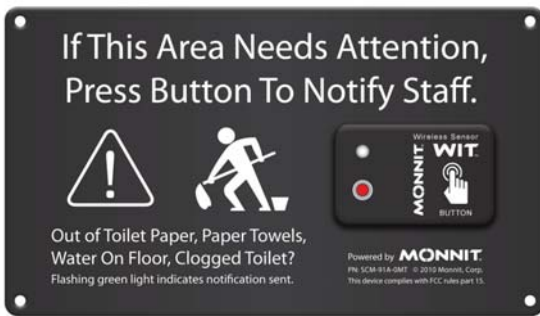
Restroom Wall Plate